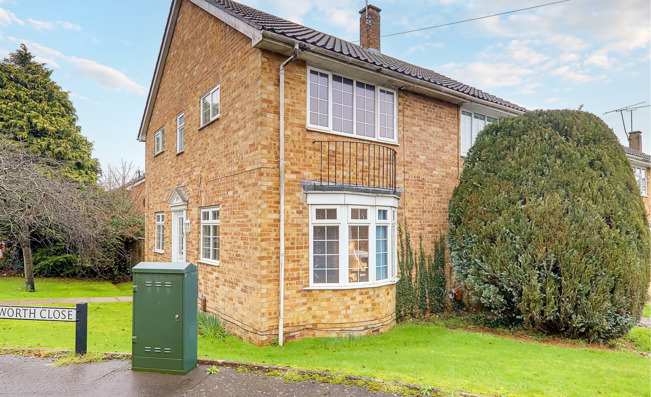
20 Wentworth Close, Worthing, BN13 2LQ Guide Price £325,000